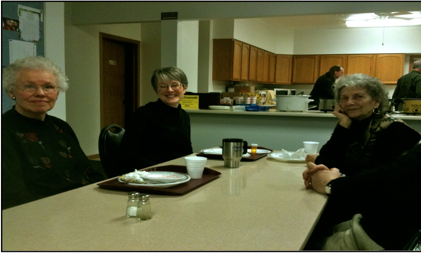
Some of the wonderful members of St. Timothy (Williamsburg), who provided the meals—and coffee!—that kept the convention going.