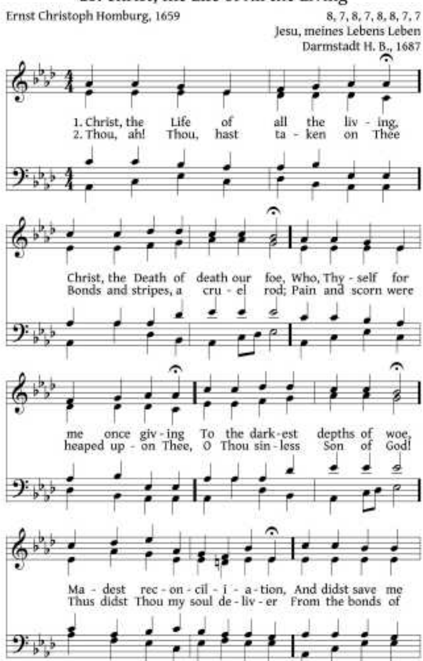
Laetare 23. Christ, the Life of All the Living