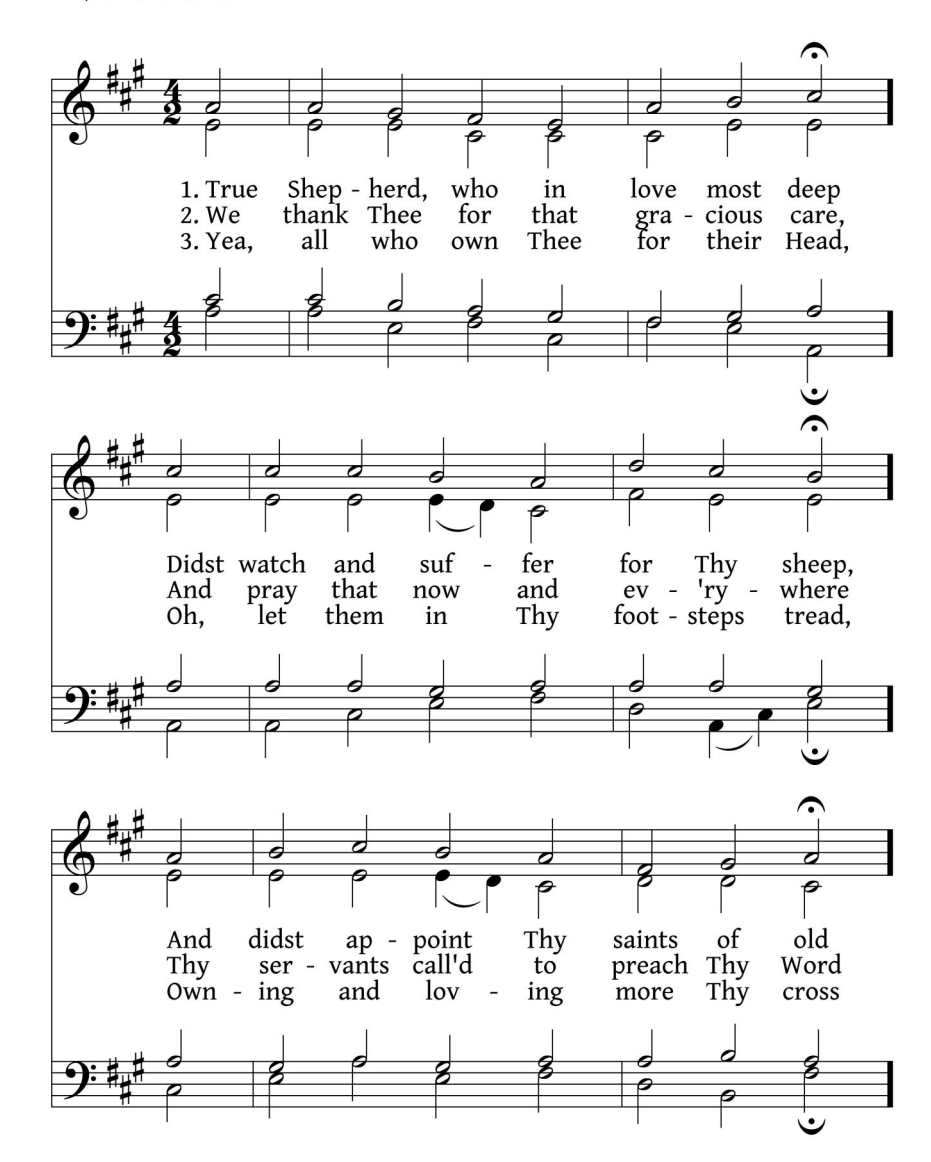
Festival of St. Timothy 74. True Shepherd, Who in Love Most Deep Tr., C. Winkworth